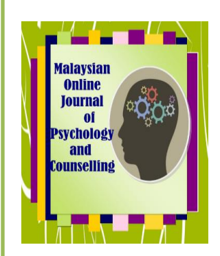
Volume 11 (2), December 2024

Keywords: Parental Involvement in Reading Activities, Reading Skills in Malay Language, Authoritative Parenting Practices