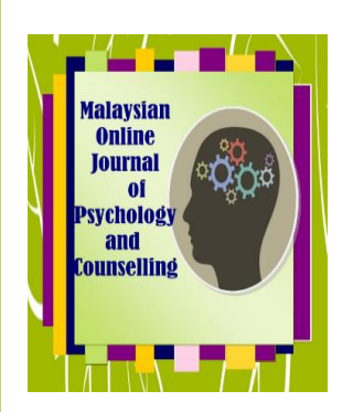
Volume 11 (2), December 2024

Keywords: Big Five Personality, Self-regulated Learning Strategy, Cognitive Strategy Use, Self-regulation, Measurement Model